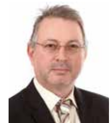
Dean Packer Expert Support

The Dispute Solutions team provides a proactive approach to assist clients in avoiding or resolving disputes. Drawing on the skills developed from a background of construction management and project delivery, the Dispute Solutions team offer a focused approach based around: