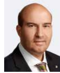
Moneer Khalaf Testifying Expert/ Arbitrator