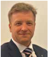
Lee Westwood Expert Support